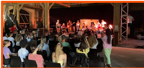
Young people at the COMMPASS young person's meet-up (2022)

The Landesjugendring Mecklenburg-Vorpommern signed a cooperation agreement with the Deutsch-Französischer Jugendwerk (Franco-German Youth Office, or DFJW for short) in May 2022. The aim of this cooperation is to establish long-term Franco-German and trilateral projects for extra-curricular activities in and with the State of Mecklenburg-Vorpommern.