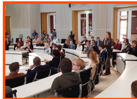
Young people at „Jugend im Landtag“, an participation project organised by the Landesjugendring / Participation Network in partnership with the Landtag

Digital participation for young people has been affiliated with the Landesjugendring Mecklenburg-Vorpommern since January 2022 and is now more heavily focused on the participation of children and young people in the digital environment. The job of the Digital Participation team is to help young people and professionals working in children and youth work, schools and public administration to use the tools provided by the digital environment to improve the participation of children and young people. They do this by running regular workshops, advice sessions and training courses. The Digital Participation team's „Talk & Tools“ podcast provides information on these issues via social media.